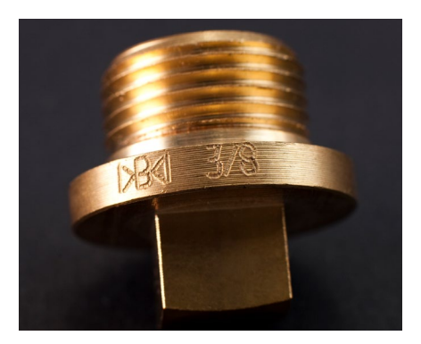
Various small parts