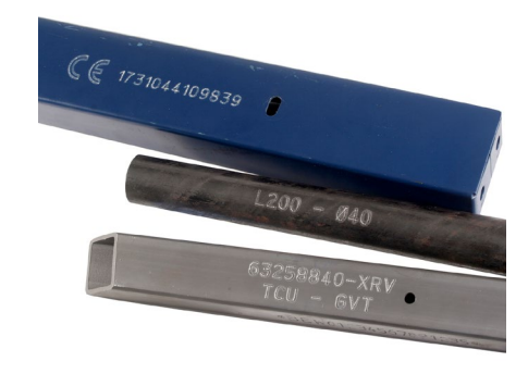
Painted, coated, raw materials