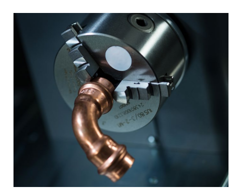
Rotary accessory for cylindrical parts marking