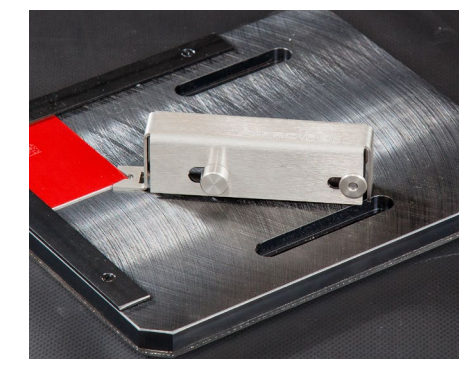
Sound-proof positioning plate with magnetic quick release clamp