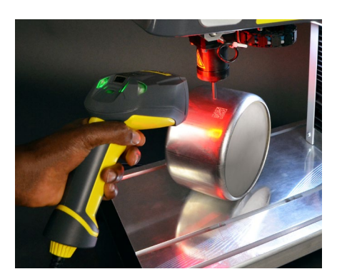
Hand-held or fixed-position scanner for code reading or checking