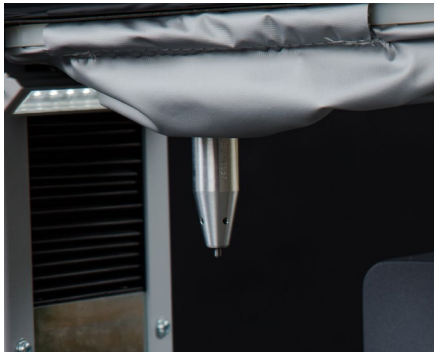
Protective below (optional)